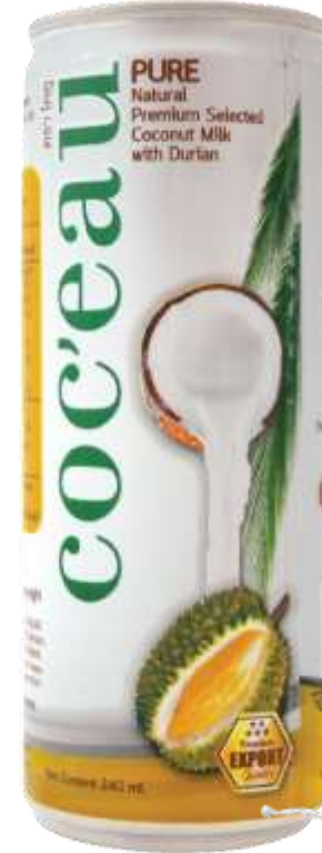
Premium Coconut Milk Drink