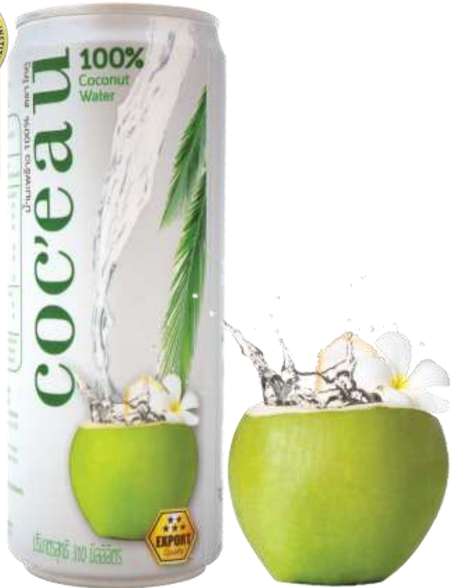
100% Premium Coconut Water